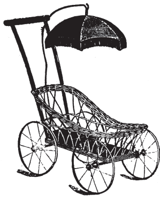
M9 — Better constructed carriages; parasol, lined, etc. . . . . $3.00, $3.25, $3.75, $4.00