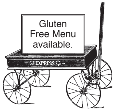
T6 — Wood box wagons . . . . . $2.75, $3.50