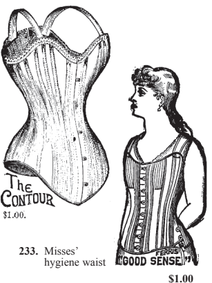
The Contour $1.00.