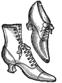
245. Genuine oiled pebble leather . . . $1.40