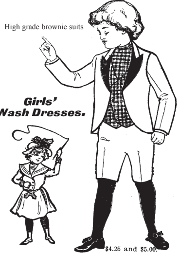
High grade brownie suits