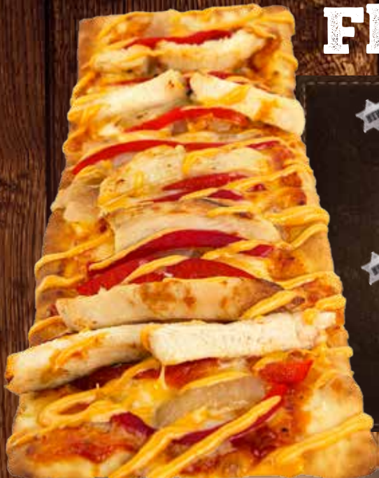
SOUTHWEST CHICKEN FLATBREAD