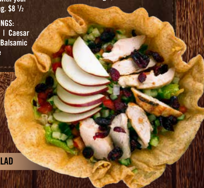
FUJI APPLE CHICKEN SALAD

Crisp romaine, bacon, Parmesan cheese, croutons topped with grilled chicken and our Gar Par™ dressing. $12 3/4