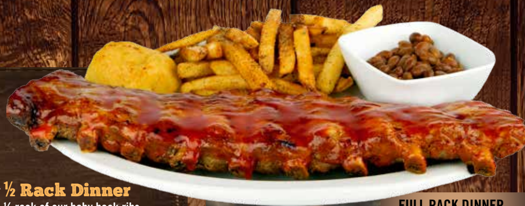
FULL RACK DINNER

A 1/2 rack of our baby back ribs basted in BBQ sauce served with a warm fire roasted cheddar and corn biscuit, baked beans and our signature fries. $18