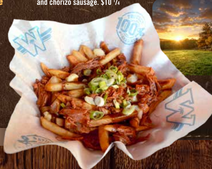
PULLED PORK POUTINE

Our signature fries loaded with gravy and cheese curds and topped with tender pulled pork. $10 1/4