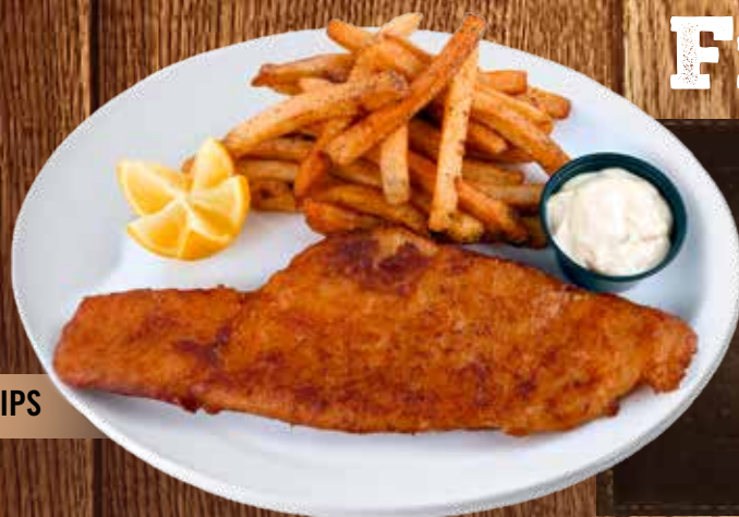
FISH + CHIPS